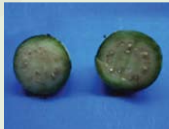
For this species, a transverse section reveals differences between mature and immature fruits. Here, an immature fruit has a hard, white flesh with underdeveloped seeds