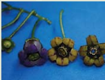
Flowers at different stages of maturity