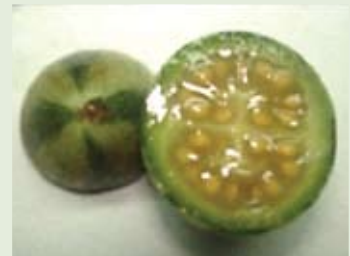
Mature fruits for this species have juicy, yellow flesh with fully developed seeds ready for collection