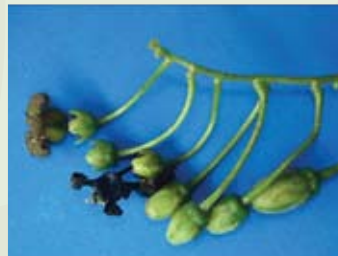
Flowers with very young fruits in the same inflorescence